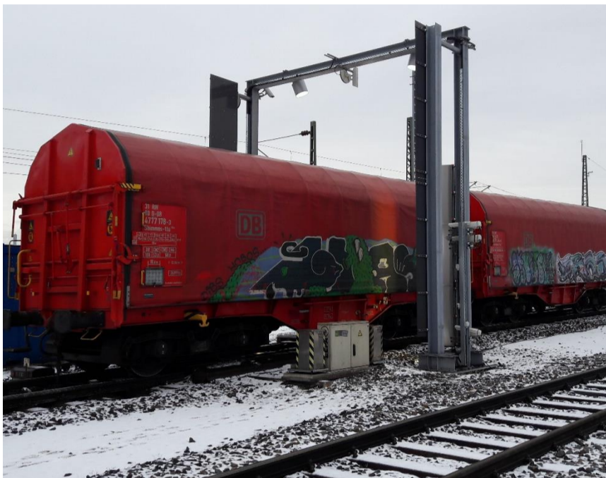
Fig 1. Camera bridge with passing cargo wagon.

To guarantee the safety of their operations, European railway companies need to maintain their assets regularly.