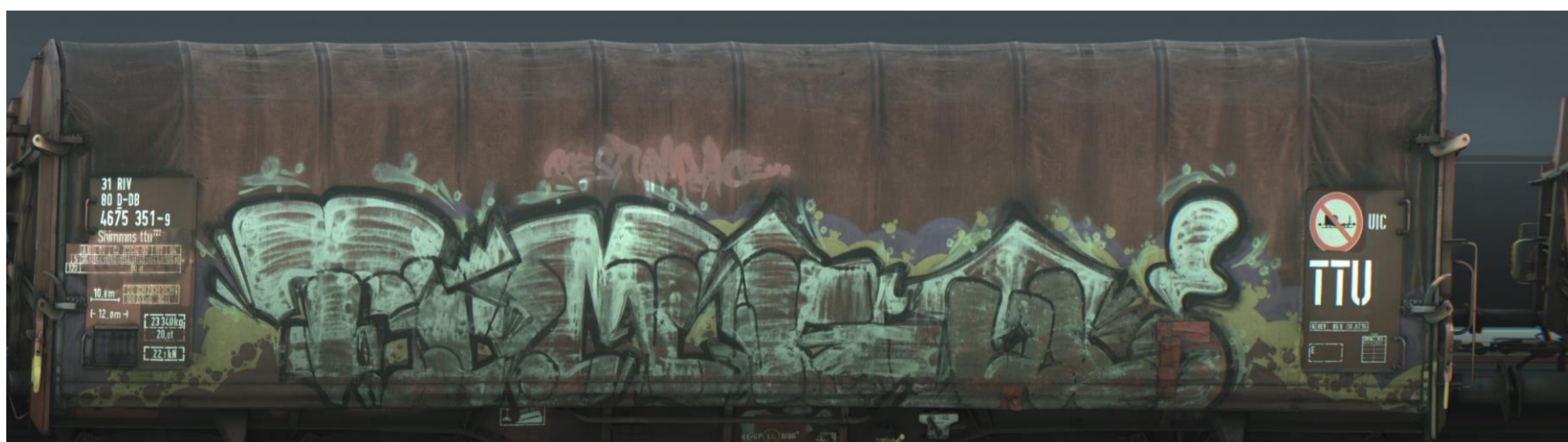
Fig 2. Image acquired by camera bridge.